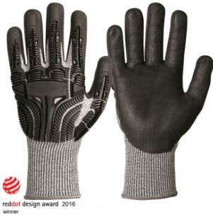
360° Cut 5 Gloves with Typhoon® and Impact Protection, Typhoon® fiber with nitrile foam coating